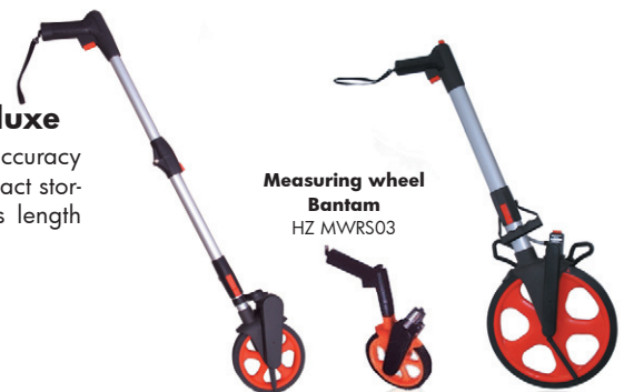
Measuring wheel 500 deluxe HZ MWRS02

Other specifications same as MW Mini 500