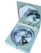
DQL-2A Pocket Compass HZ PCHQL2A