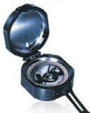
DQY1 Pocket Compass HZ PCHDQY1