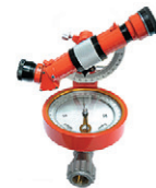
DSL-1 Forestry Compass HZ ODLHDSL1