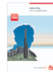
Leica Viva Overview brochure

Illustrations, descriptions and technical data are not binding. All rights reserved. Printed in Switzerland – Copyright Leica Geosystems AG, Heerbrugg, Switzerland, 2010. 781652en – XI.13 – galledia