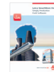
Leica SmartWorx Viva Product brochure