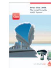
Leica Viva GNSS Product brochure