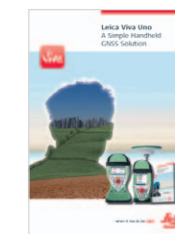
Leica Viva Uno Product brochure

Leica Geosystems AG Heerbrugg, Switzerland www.leica-geosystems.com