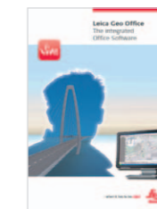
Leica Viva LGO Product brochure