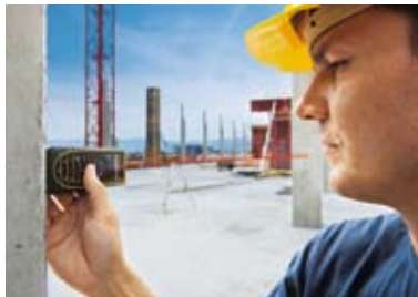
Measuring long distances thanks to Power Range Technology™ from Leica Geosystems.

More than 15 years ago Leica Geosystems brought out the first hand-held laser distance meter and revolutionised the world market. Since then we have set the standards for productivity in modern measuring. A lively spirit of innovation inspires our highly motivated development engineers to keep coming up with new ideas. They lead to products that win over the customer with their robustness, reliability and precision. Leica DISTO™ eases our customers' everyday tasks.