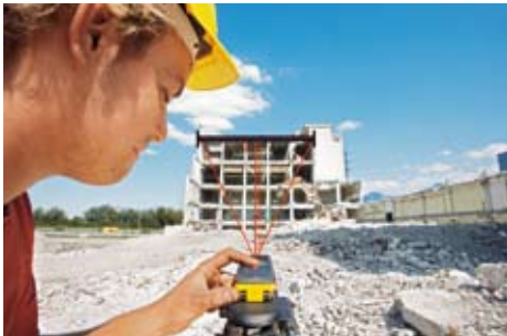
The in-built digital Pointfinder provides you with an easy way to point precisely at long distance.