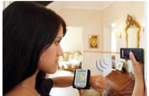
The BLUETOOTH® interface means you can transfer data quickly, without errors.