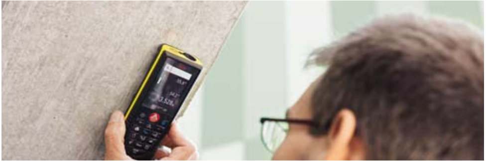
Any tilt can be determined in the simplest of ways by placing the housing on the sloping surface.